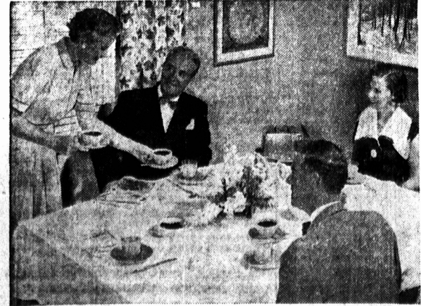
New It's "How do you like your COFFEE?" Made just the right strength for each individual taste, "custom-made" cups of new Instant Chase & Sanborn are fast becoming a breakfast vogue among Canadian families.

New Instant Chase & Sanborn is 100% real coffee—and tastes like it. Rousing, rich-flavored coffee—ready with its magical lift the moment you add the hot water. It's your kind of coffee—made by people with nearly 100 years of coffee experience. One sip and you'll agree—it's so good you'll make it your regular coffee!