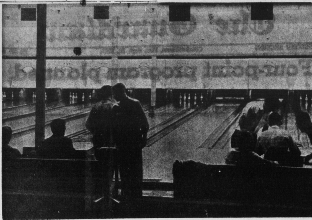
ADDITION OF 14 NEW LANES WILL EASE JAM FOR BOWLING TIME IN CHARLOTTETOWN