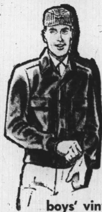
boys' vinyl motorcycle jackets

Made of vinyl plastic, will not pull or crack; wipes clean with soap and water. Self collar with wool knit cuffs and waist band; zipper closing; 4 pockets; warm quilted lined. Black with silver nail heads, 8-18 years.