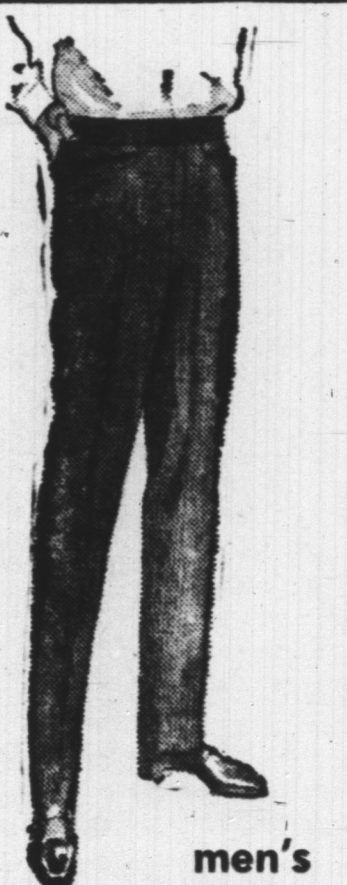
men's dress trousers

Made by Utex in handsome styling with wear guarantee; nylon knitted collar, cuffs, waist band in contrasting stripes which match shoulder bands. Red/Black, White/Black, Black/Red. Zipper closure. Sizes 36-42.