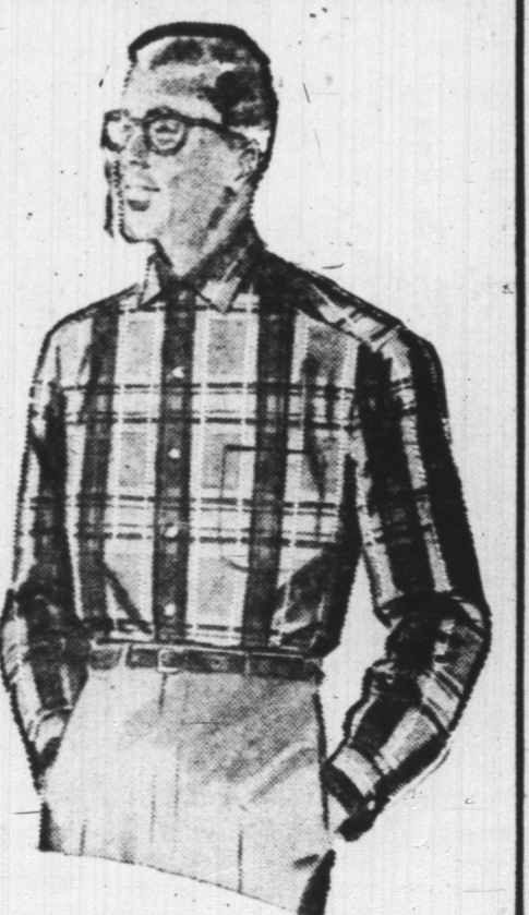
men's toke drip dri... sport shirt

Styled with two breast pockets, long sleeves. Fully washable fine plaid in colour of red and grey. Sizes S.M.L.