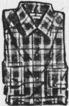
boys' flannel shirts

Sizes 10 1/2 - 11 1/2. Beige, grey, charcoal and wine.