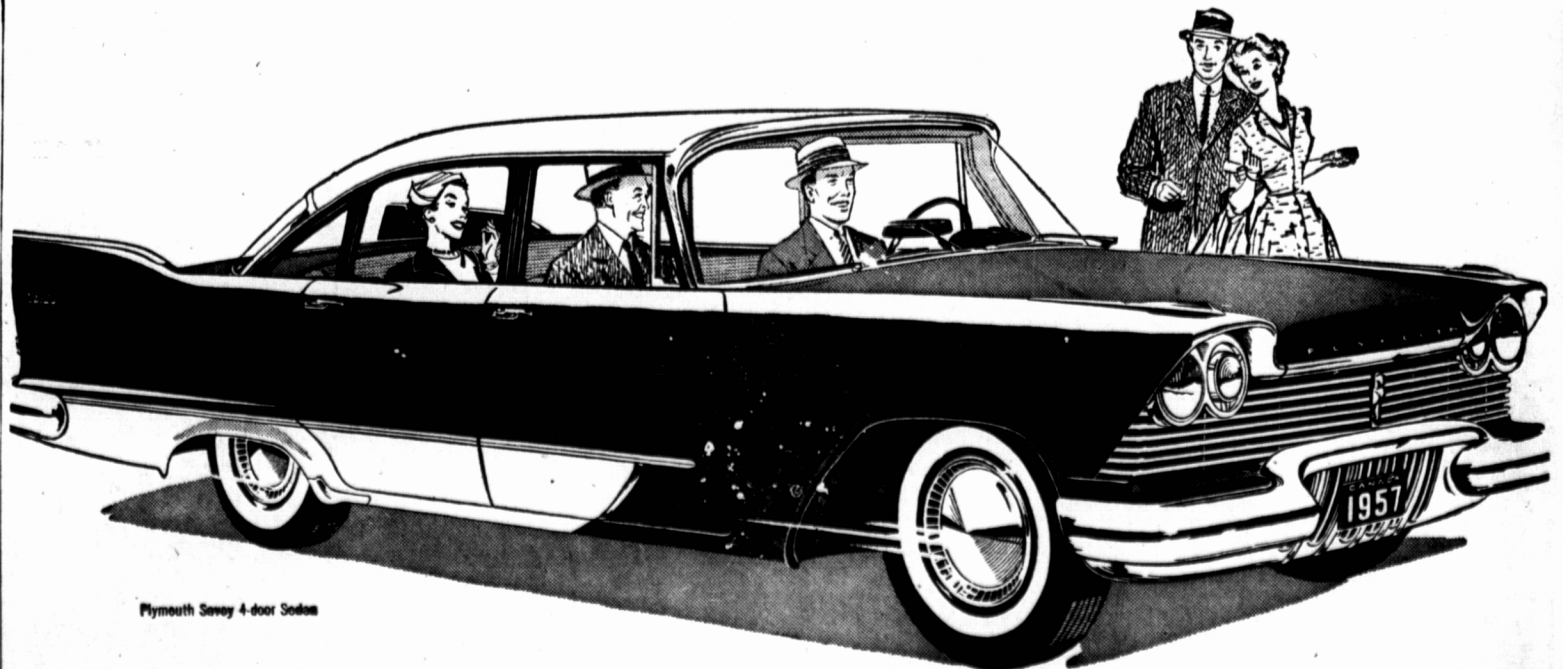
Plymouth Sevey 4-door Sedan