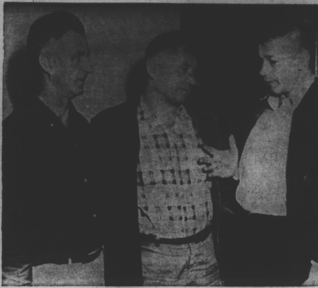
CAVE IN SURVIVORS