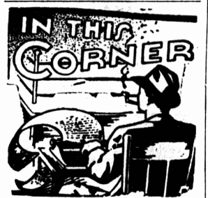
The stage is being set in New York and Cleveland for the greatest sports event in the world of baseball and perhaps even in the realm of sport itself—the World Series.