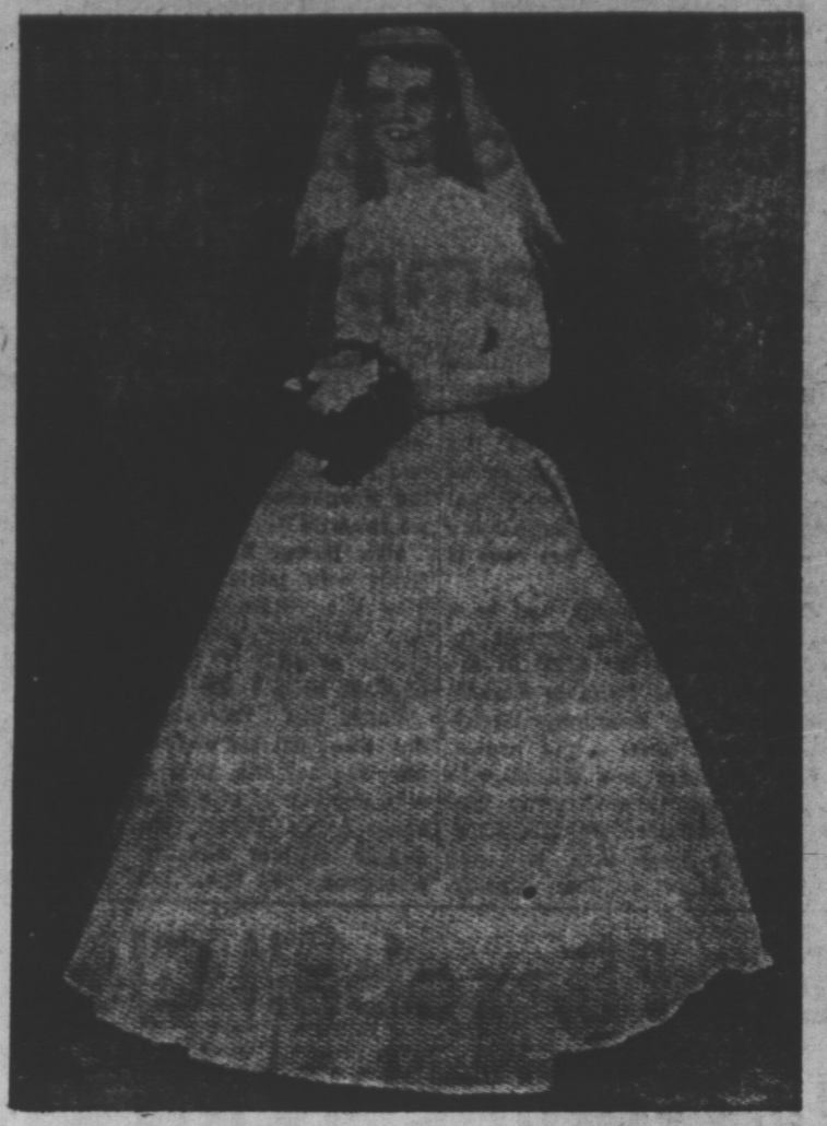
YOUR WEDDING DAY TO REMEMBER FOR PORTRAITS OF DISTINCTION MAKE YOUR APPOINTMENT EARLY. MEYERS STUDIO 128 RICHMOND ST. DIAL 9918

We will tint Fabric, Linen or Brocade shoes to match your wedding gown. 24 hour service. Per Pair . . . . . 1.00 We also have WHITE SHANTUNG PUMPS (suitable for tinting) in Cuban and hi heels—AAA, AA and B widths. Pair . . . . . 9.95 Other lines suitable for Tinting . . . . . 7.95 LePAGE SHOE CO. LTD. DIAL 4748 CHARLOTTETOWN "The Home of Good Shoes Since 1920"