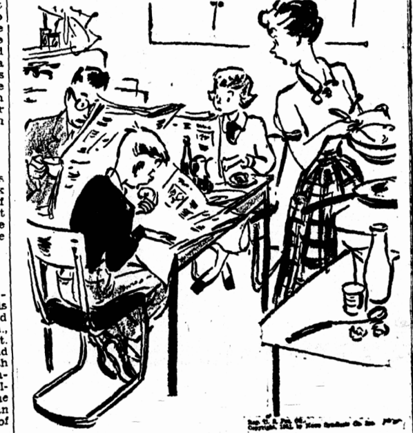
"You try to keep up on everything that's going on in the world, but nobody's noticed I dyed my hair last week!"