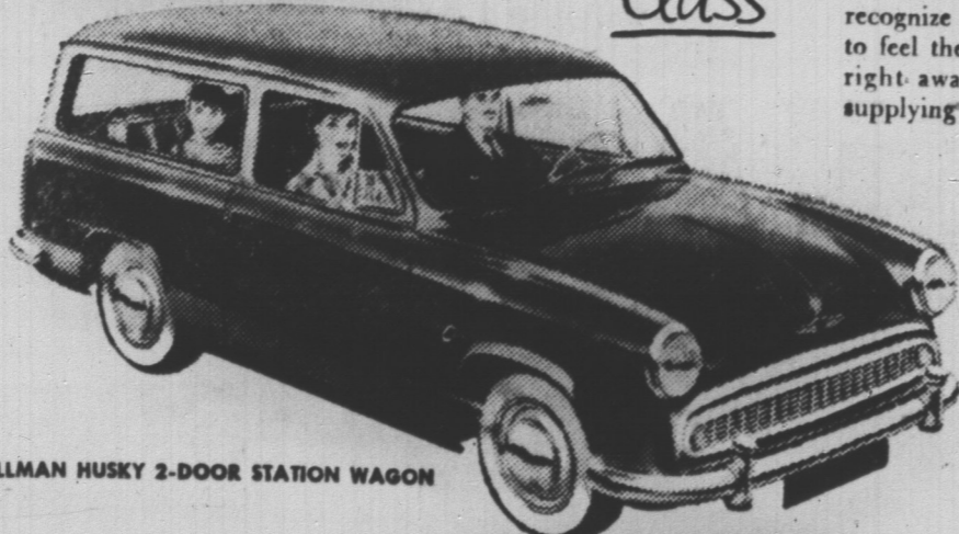
HILLMAN HUSKY 2-DOOR STATION WAGON

You have but to see this "triumphant trio" to recognize their quality. You have but to drive them to feel their pull. Visit your nearest Rootes dealer right away. There are over 200 across Canada, supplying parts and service from coast to coast.