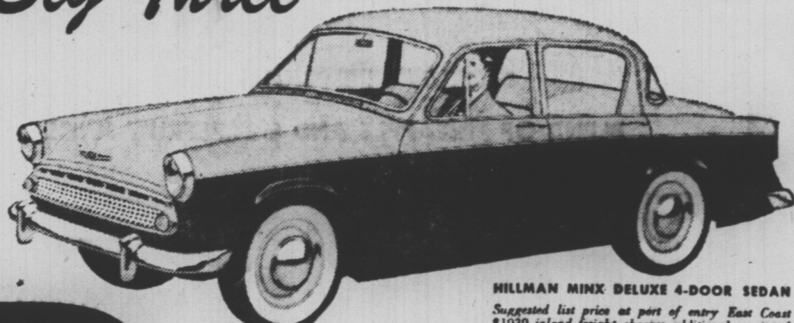
HILLMAN MINX DELUXE 4-DOOR SEDAN Suggested list price at port of entry East Coast $1939 inland freight charges additional, equipped with built-in heater and defroster, oil bath cleaner, turn signals, electric windshield wipers, twin wind-tone horns, tubular tires and spare, bumper guards, two-tone finish. (W/hite walls extra).