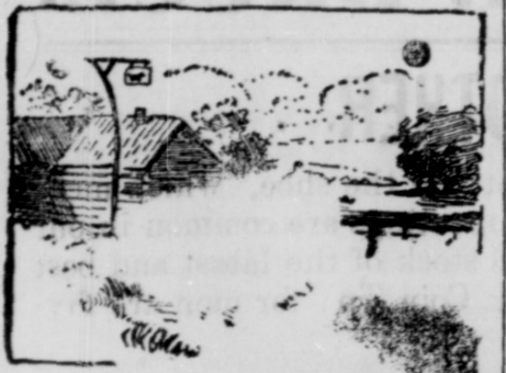
Fifty Years Ago.

How to Live Long. Old Parr, it is said, died from the effects of an unusual burst of luxury, and many other very old people, after living in the simplest possible way for many years, have succumbed at last to the effects of luxury indulged in on birthdays or other festive occasions. The oldest inhabitant of Yarmouth, who died a few days ago, is another illustration of the fact that the worst thing that can be done for very aged people is to supply them with luxuries beyond what their systems have grown accustomed to. The old man, who was well into the nineties, had every promise of becoming a centenarian, when he was unfortunately discovered in connection with the jubilee festivities, and, as the oldest inhabitant, was given the place of honor at the local festivities and was to be provided with the usual 'comforts for his declining years' for the future, as he was in very needy circumstances. He has responded promptly by dying.—Westminster Gazette.