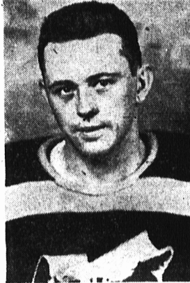
Gordon scored two of the goals and Whitlock one. In addition Whitlock picked up an assist later in the game.