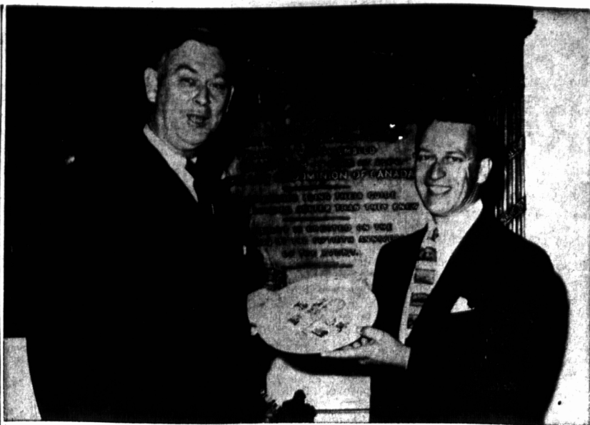
THE PRESENTATION YESTERDAY