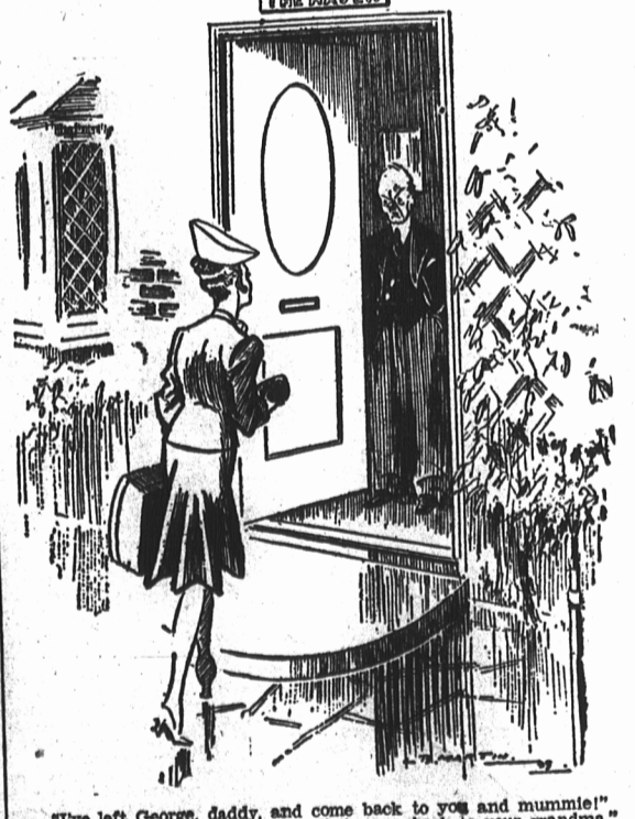
"I've left George, daddy, and come back to you and mummy!" "Well, your mother isn't here. She's gone back to your grandmamma."—Humorist.