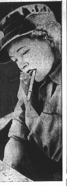
In style, women wait for war in England. Her cigaret in long holder, a book before her, one of 130 girls in Women's Auxiliary Territorial Service camp at Surrey relaxes during respite from military training.