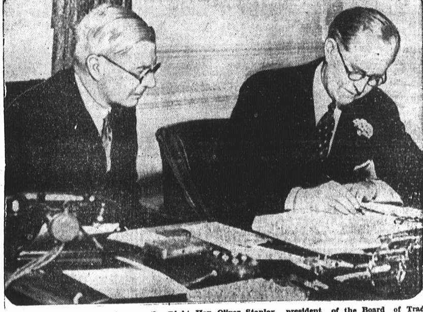
Ambassador to Great Britain, and the Right Hon. Oliver Stanley, president of the Board of Trade signing on behalf of their respective Governments the British-American Barter Pact, in London, England.