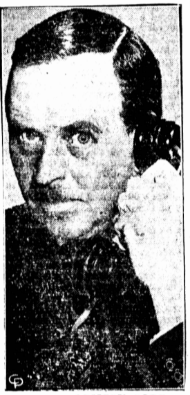
MAJOR ORMSBY-GORE Former Commissioner of Works who was appointed Secretary for the Colonies last night.