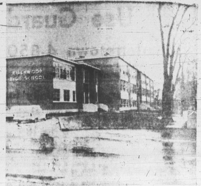
BIRCHWOOD HIGH SCHOOL