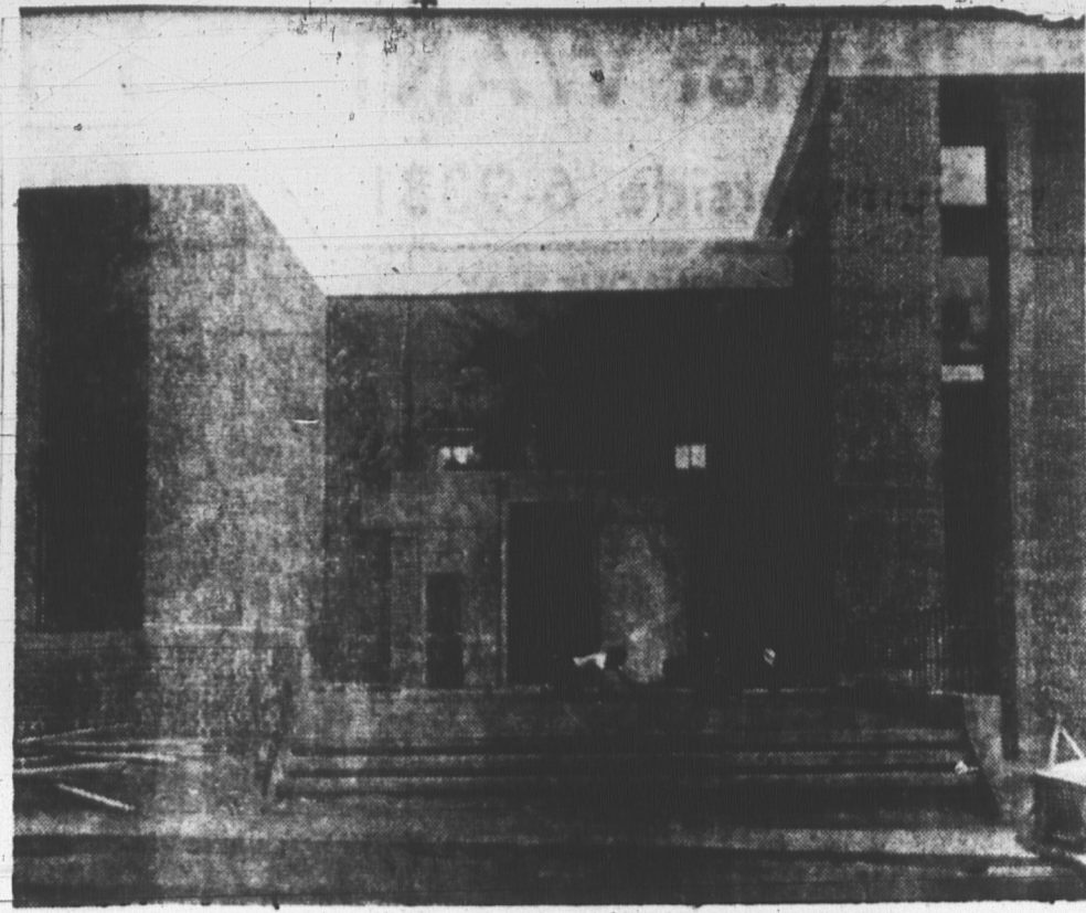
NEW CENTRAL ST. HIGH SCHOOL, SUMMERSIDE