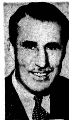
HON. GEORGE HEES

The main floor will have a drill deck in the centre with the ceiling extending to the roof. Along the sides there will be offices, classrooms, workshops and storerooms. On the mezzanine floor there will be further class rooms. There will be a men's mess, a chiefs' and petty officers' mess and officers' wardroom. There will also be space for additional offices. The classrooms will be so constructed that they can be opened up for one larger classroom or confined to a size suitable for the instruction of smaller groups.