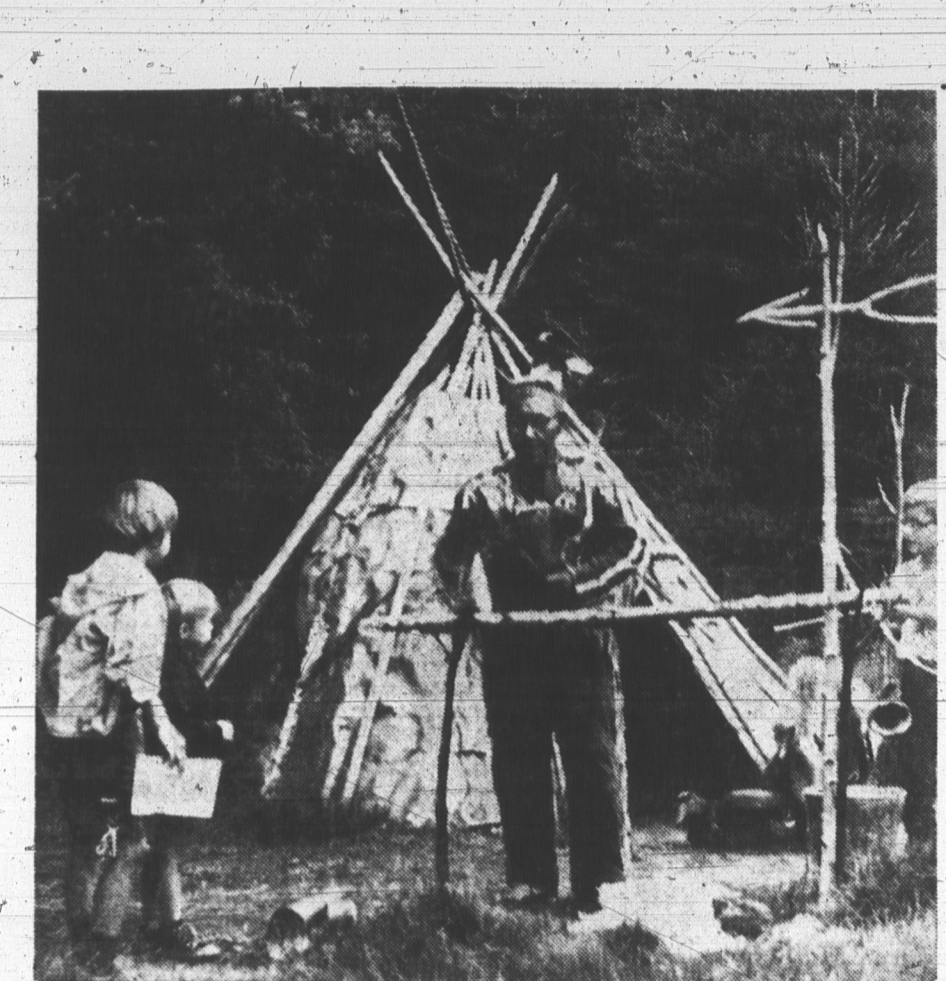
Mie Mac Indian Village located at Rocky Point, P.E.I.

Island Made Visitors Welcome ● Yarns ● Blankets ● Auto Robes ● Island Tartan Blankets Made of 100% Virgin Wool WM. CONDON and SONS 65 Queen St. Dial 4-8712 Charlottetown