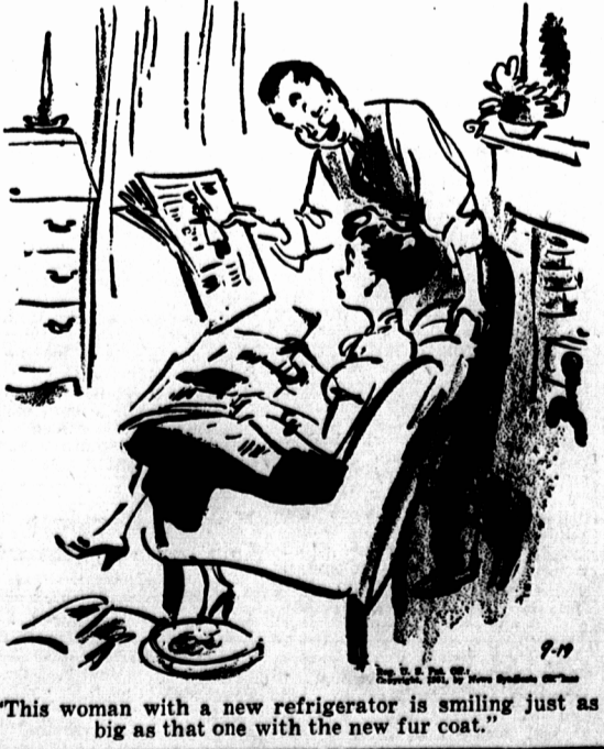
"This woman with a new refrigerator is smiling just as big as that one with the new fur coat."