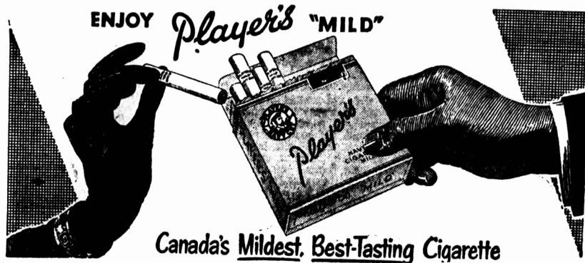
Canada's Mildest, Best-Tasting Cigarette

TO TOUR POLAND LONDON (Reuters) — A group of British Labor party members of Parliament will visit Communist Poland for two weeks early next month, the Polish embassy announced Thursday. A spokesman said the group "expressed a wish" to get first-hand knowledge of Poland's economic and cultural development.