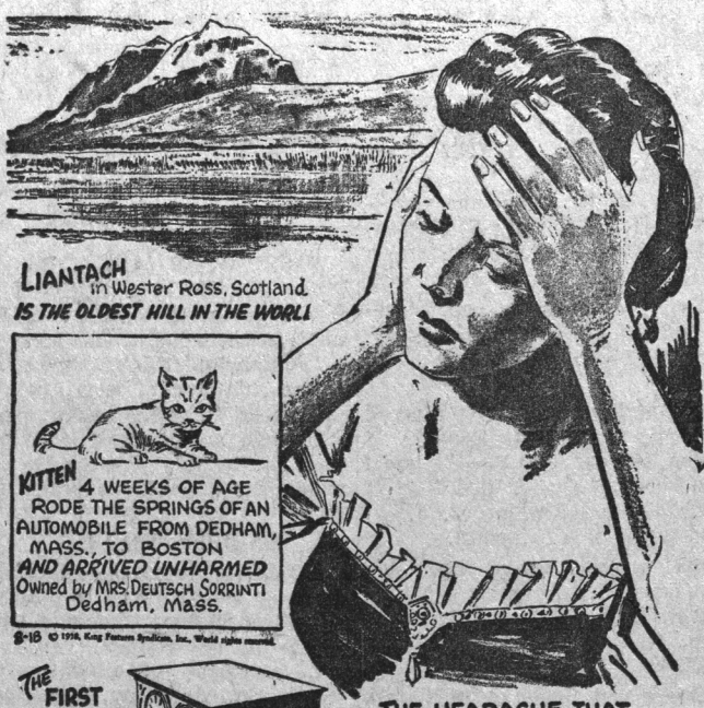
LIANTACH In Wester Ross, Scotland IS THE OLDEST HILL IN THE WORLD