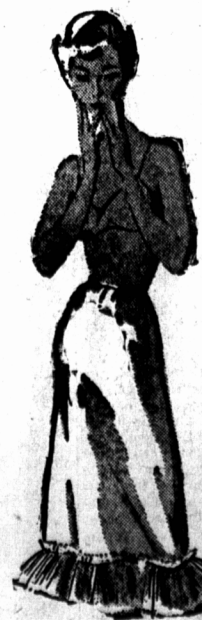
Cotton HALF SLIPS

Made of fine white cotton batiste with an elastic waistband, deep, wide embroidered flounce and a shadow panel. Sizes, small, medium and large, priced—