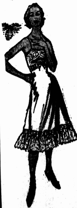
Cotton Batiste SLIPS

Lavishly trimmed with fine eyelet embroidery. The flounced skirt has a shadow panel and is snugly fitted at the midriff. The camisole top is ideal for under sheers wear. Sizes 32 to 42. Priced—