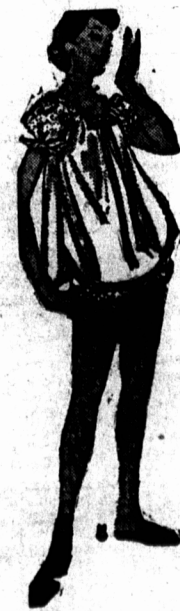
"Baby Doll" PYJAMAS

Cunning and dainty, fashioned of floral patterned, glazed cotton pique. The top is full skirted with a lace edged yoke, underneath are woe bloomer briefs. Sizes medium and large, priced—