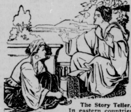
The Story Teller.

When cheese is in the curing room, every day when you turn it brush all the surface over very thoroughly and stiffly to rub off any eggs of the cheese fly that may have been deposited there. The cheese fly is fond of laying its eggs in cracks, and these must be very carefully watched. If skippers make their appearance in these cracks in spite of your care, cut the walls of the crack entirely out to remove every egg or skipper. Then get some soft cheese and fill the crack out even with the surface.