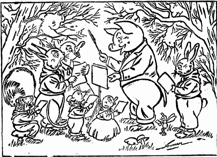
When you have located the ten naughty creatures who have not turned up for choir practice, you can colour the picture and use it as a Christmas Card.

have a small piece of white linen, similar to the average type of hankie, concealed in your left hand. Now, when you twist the handkerchief through your cupped hand, it is the separate piece of linen you draw up between your thumb and fingers and it is this same piece of linen that you burn. As you stub it out with your right hand, you can easily screw up the charred remains and conceal it in your hand while you hold up the undamaged handkerchief.