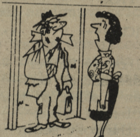
Have you been discussing Reaganomics again?"

Copies of the report Financial Plan 1983-84 are available from the MPHEC, P.O. Box 6000, Kings Place, Fredericton New Brunswick, E3B 4H1 (Telephone 506-455-5064)