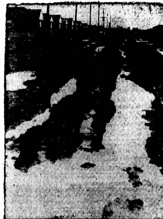
McAllister Rd., south of Sheppard Ave., North York.

THE ABOVE PHOTOGRAPHS APPEARING IN A RECENT ISSUE OF A TORONTO NEWSPAPER — THE GLOBE AND MAIL (Conservative) — SHOW EXISTING CONDITIONS IN CANADA'S ONLY CONSERVATIVE GOVERNMENT PROVINCE.