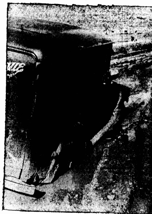
Delivery truck bogs down on St. Clair Ave. E.