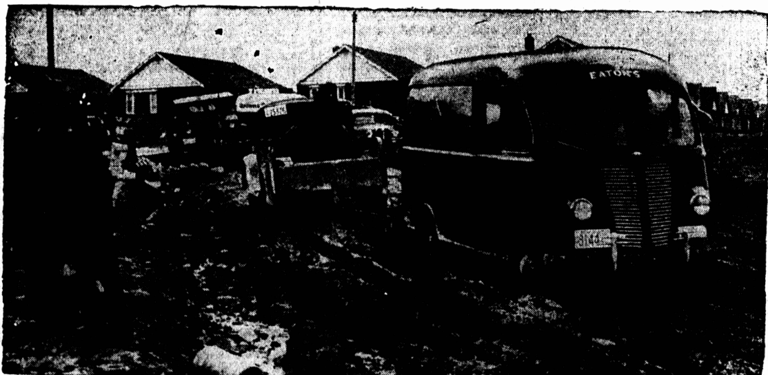
Delivery truck was mired two and a half hours on Stellarton Rd. Tow truck also got mired until four-wheel-drive truck with winch arrived to pull both of them out.