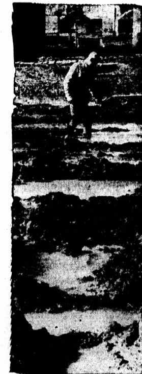
Visiting the neighbors is a sticky problem.