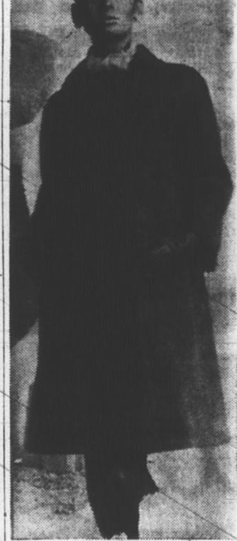
HIGH-WAISTED COAT by Castillo

She couldn't choose just one and she isn't going to. Besides, if she has lots of colors her fashion looks will be more alive and ready for "swinging." Won't big Sis and Mom be jealous?