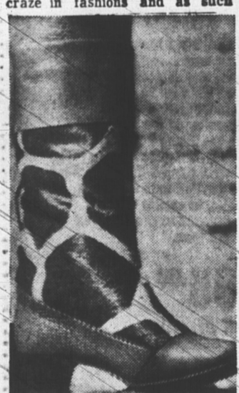
THE COSSACK BOOT Kangaroo leather

All these side-line heroes in the Paris shows, amusing as they are, stem from the teenage craze in fashions and as such