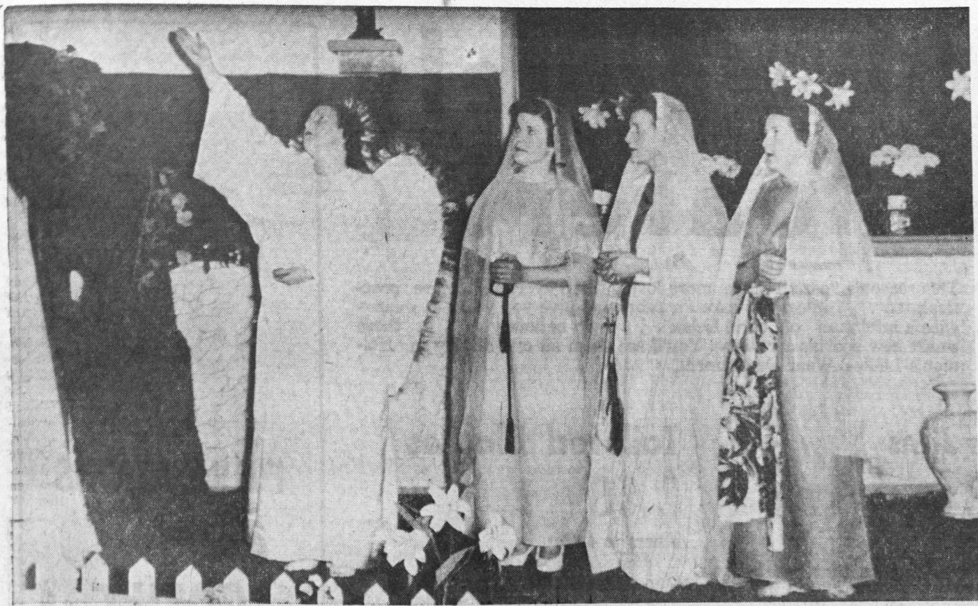
PRESENT EASTER PLAY

"The Gardener", an Easter drama was presented in O'Leary Baptist Church on Good Friday and Easter Monday and will be repeated in Summerside Baptist Church hall on Wednesday. It is produced by O'Leary members of the Baptist World Wide Guild.