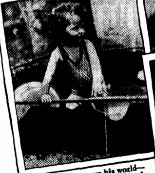
CURLY TOP surveys his world—how the snapshot will be treasured.