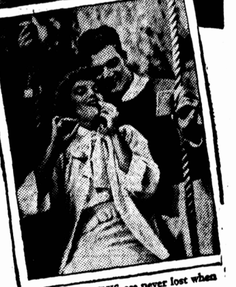
DAYS LIKE THIS are never lost when a Kodak is included in the party.