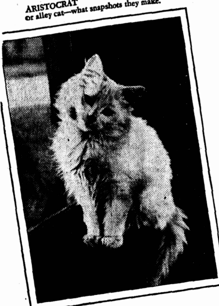
ARISTOCRAT or alley cat—what snapshots they make.

SNAPSHOTS YOU'LL TREASURE are waiting to be taken this week-end