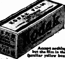
Accept nothing but the film in the familiar yellow box.