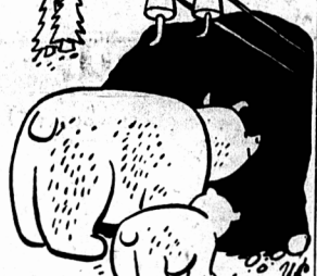
Cave for Kilowatts

Power will flow to Alcan's future aluminum smelter at Kitimat, B.C., from a power plant built inside a man-made cave which stretches a quarter of a mile inside a mountain! What's more, a tunnel will be driven ten miles through the mountain, to carry water to drive the turbines.