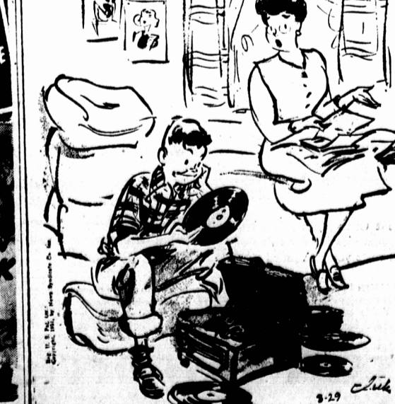
"But Junior, I can't find a single school that has a course for disc-jockeys."