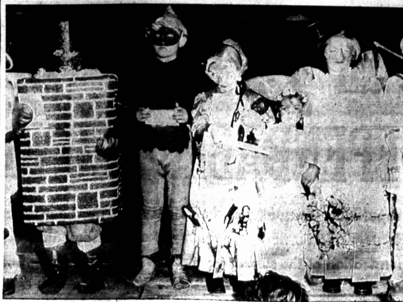
A GROUP of junior winners were dressed who attended the Summerside Kinsmen's Halloween party on Wednesday evening.