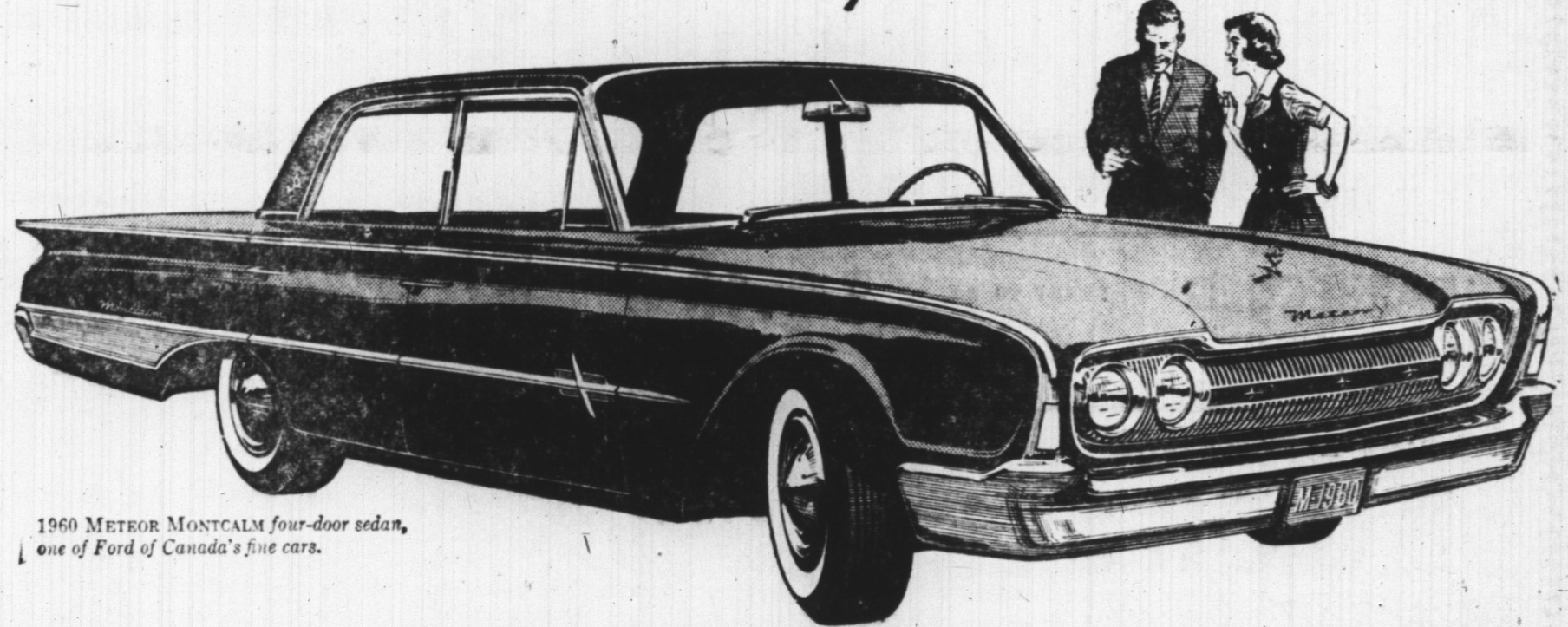
1960 METEOR MONTCALM four-door sedan, one of Ford of Canada's five cars.