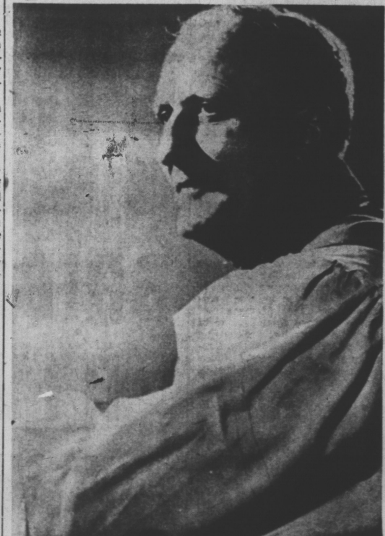
GUEST OF QUEEN

MONTREAL (CP) — The fact that "no foot of NATO soil has fallen to aggression" is proof that its aim of peace through strength is valid.