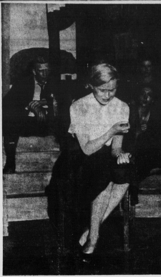
INHERIT THE WIND—THURSDAY