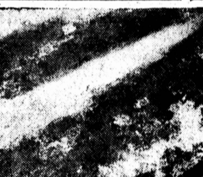
Before Newspaper Features Reg. U.S. Pat. Office