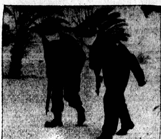
PLENTY OF GRIT —British soldiers on patrol in Egypt's Suez Canal Zone lean into the wind of a sand storm. Handkerchiefs over their faces protect them from the stinging particles and enable them to breathe. Sand is an enemy that gets into everything—food, clothes, bedding, eyes and lungs.