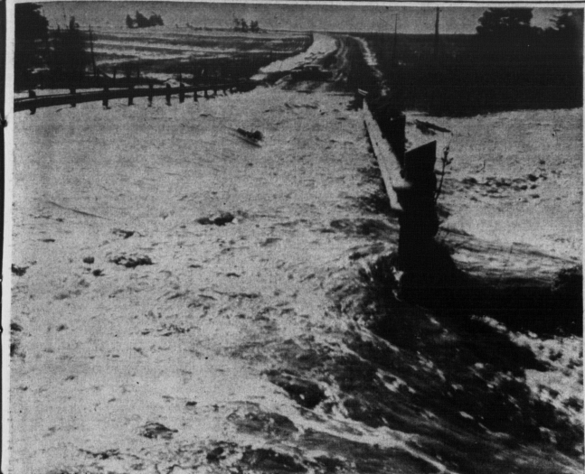
SOME APPRECIATION of the destructive flow of water Sunday and Monday in this province can be gained by this picture. Here is a torrent of water pouring over the washed-out road at Freetown, near Scates Pond.

province can be gained by this picture. Here is a torrent of water pouring over the washed-out road at Freetown, near Scates Pond.