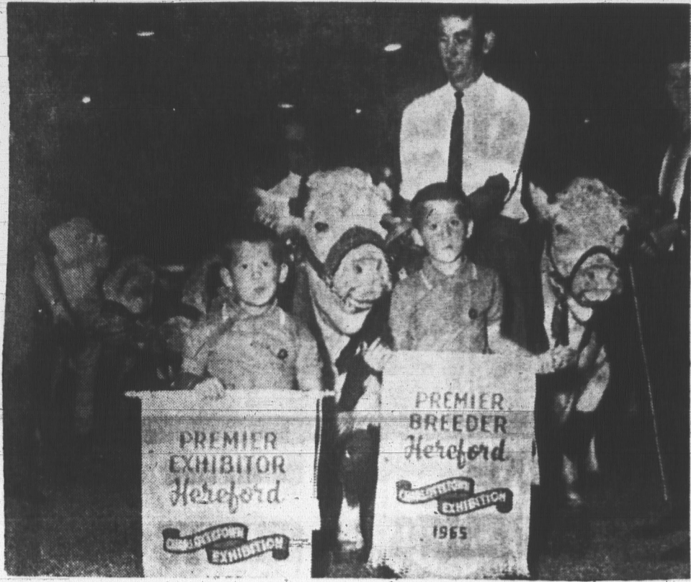
FATHER AND SONS GET INTO ACT