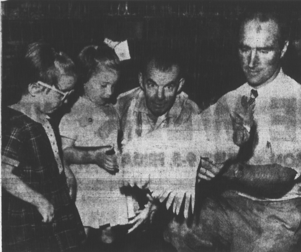
YOUNG LADIES ADMIRE POULTRY EXHIBIT