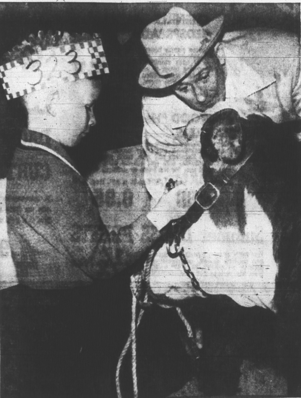
JUDGE TAKES CLOSER LOOK

"I never thought of being an actress—always a dancer. The thing I wanted most was to dance in a Broadway show. Naturally I expected to be in the chorus."