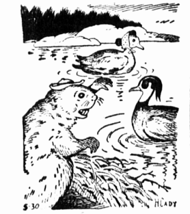
"Why don't you nest on the ground or on an old stump like other ducks" asked Paddy the Beaver.

Because we don't like nesting right out in the open. We like to be inside out of the rain and the sun, and where I do when I am sitting on eggs," replied Mrs. Beauty.