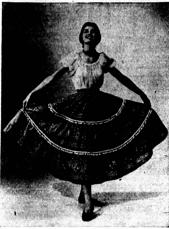
Eight bodonnans equal one gay red skirt for born dancers. The skirt is made in three tiers, each section fuller than the one above. Belt- fringe covers the seams and adds a bouncing trim to the skirt. For a direction leaflet on how to make this square dance skirt called BANDANNA BELLE, just write to the Needlework Dept. of this paper asking for Leaflet ST-5. Please enclose a stamped, self-addressed envelope.