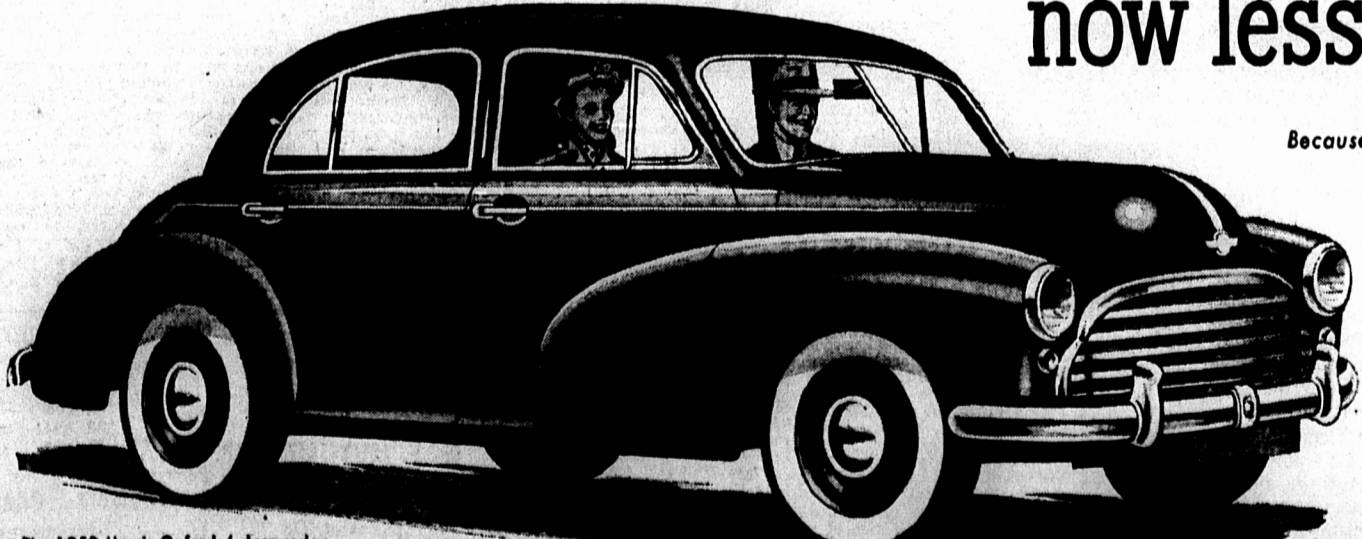
The 1952 Morris Oxford 4-door sedan Cruises economically at 60 miles per hour