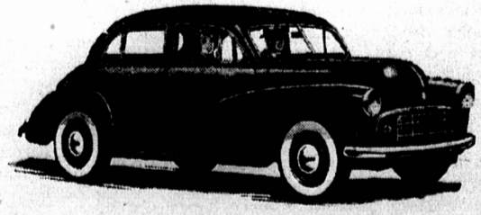
The 1952 Morris Minor 4-door sedan Up to 50 miles per gallon of gasoline