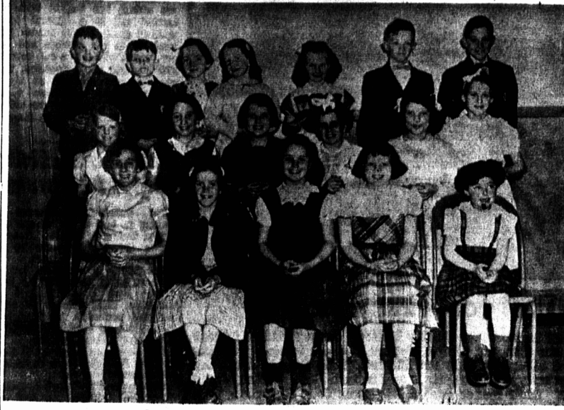
Chorus Wins Two Firsts

The opinion of the adjudicator was expressed concerning the lack of uniformity in the clothing worn by the chorus contestants. "Some (Continued on page 13 col. 7)