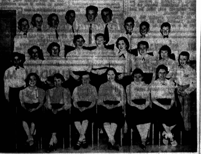
Hard Work Brings Rewards