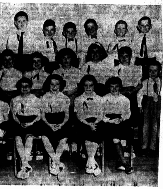
King's County Children In Festival

Since Eden called the election to increase his over-all majority of 19 in the present 525-seat House of Commons, Conservatives have been optimistic of boosting their parliamentary strength.