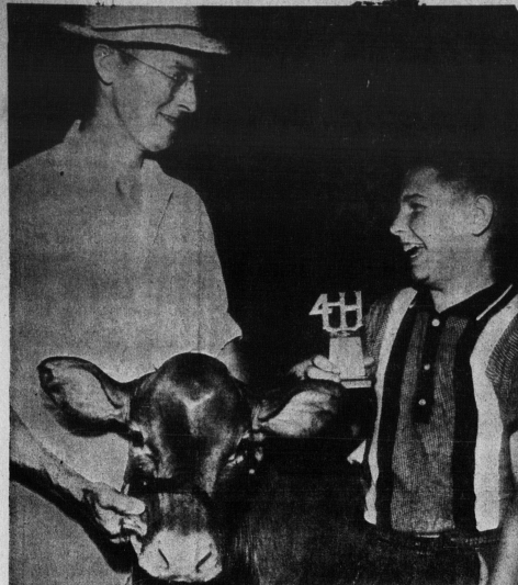
BOY SHOWS HIS DELIGHT