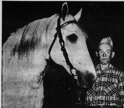
MIGHTY PROUD OF HIS HORSE