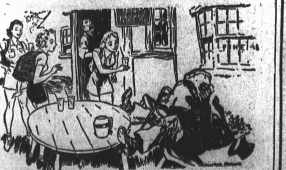
"We've ordered one too many. Would you care for a lime juice and soda?" —Humorist.