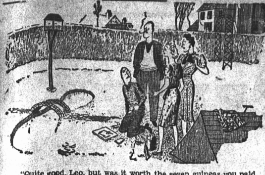
"Quite good, Leo, but was it worth the seven guineas you paid the National Postal college for their course on bridge building?" -Humorist.