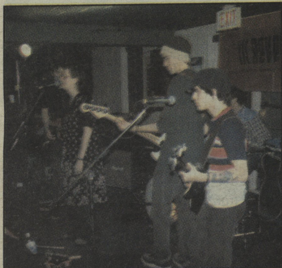
Eyes For Telescopes never sounded better.