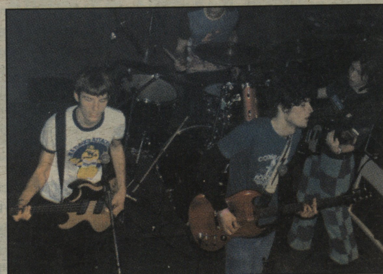
The lady in The Burdocks had stylish pants.