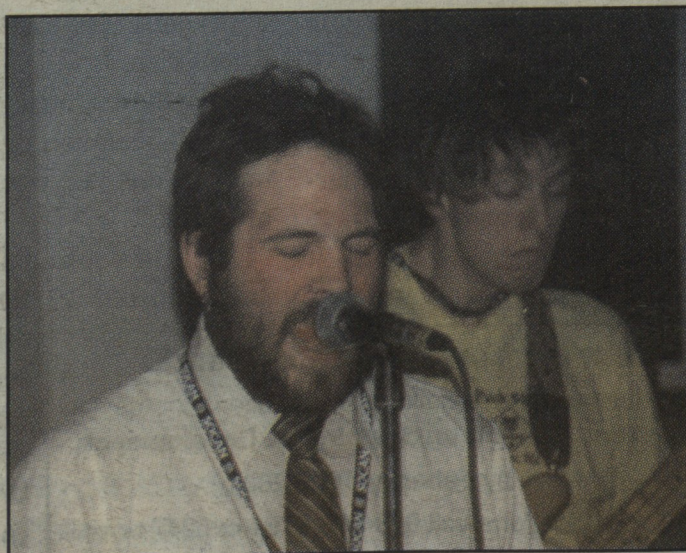
The Rude Mechanicals naturally played a great set.