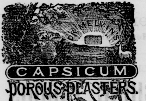
The Greatest Medical Discovery since the Creation of Man, or since the Commencement of the Christian Era.

They respectfully solicit the patronage of their customers, and the public generally. Ch'town, May 8, 1878.