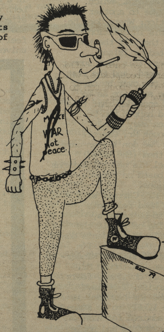
adapted from the Frost Leader

Bad Points: You ever see anyone put a pin in their nose or ears? Grotesque city!