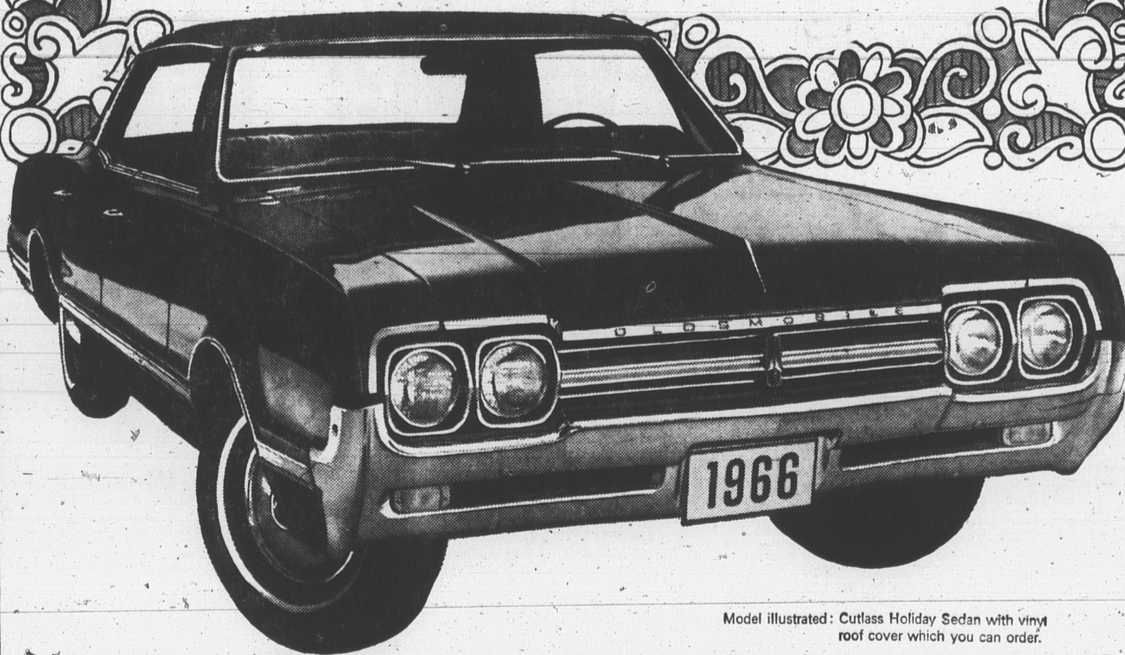
Model illustrated: Cutlass Holiday Sedan with vinyl roof cover which you can order.