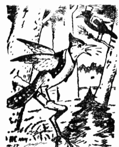
Again Sammy Jay screamed "Thief! Thief! Thief!"

This is nearly always true. It is also true that usually one of two do know what to do, and do it. Mrs. Grouse, well hidden where the could see without being seen, was watching Thunderer and another Grouse fighting. She knew why they were fighting. Yes, sir, they were fighting for her. Yes, sir, they were fighting for her. That in itself was exciting. Would Thunderer win, or would it be the handsome stranger? Which did she want to win? She wasn't sure. Sometimes she hoped Thunderer would win. Sometimes she hoped the handsome stranger would win. At least, she thought she hoped this.